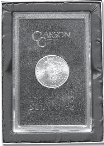
An 1884-CC dollar inside special Governors' Conference GSA box.

The GSA hard pack, housing the 1884-CC dollar, is nested in the typical indentation in the box, only it has a sheet of satin. The coin and certificate of authenticity are in the usual Mint condition. I