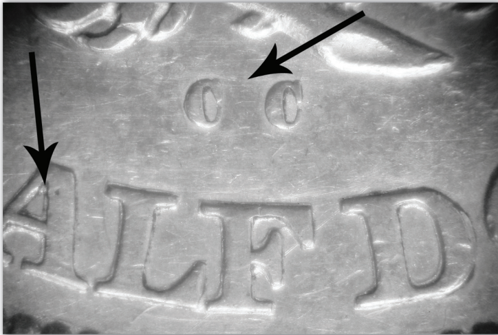
(Above) Reverse of 1876-CC WB 1-A half dollar. (Below) Closeup of wide-spaced "CC" mintmark, and doubling on "A".